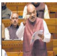
Point of view: Home Minister Amit Shah speaks in the Lok Sabha on Wednesday.

■ It also empowers the Lieutenant-Governor to nominate three members to the Assembly - two members from the Kashmiri migrant