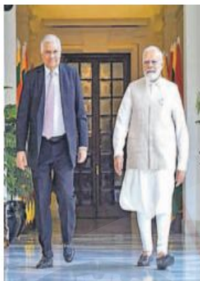
Prime Minister Modi with Sri Lankan President Ranil Wickremesinghe.